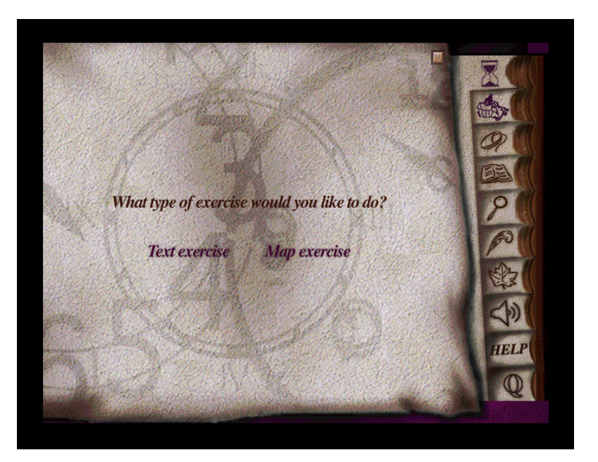
Exercise Main Menu

Text exercise has gapfill sentences where the correct answer has to be dragged from a list of answers at the bottom of the screen. Clicking on Main will take you back to the Exercise Main Menu. To repeat an exercise, click on Try Again .